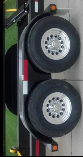
60291 - 235/85R LRG Steel Belted Radial Tire On Aluminum Wheel 800681 - Removeable Rear Fender