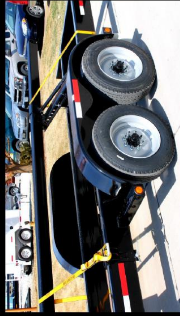
60237- 8000 Lb. Torsion Axle and 17.5 Tire Option For D.O.T. Models