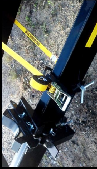
Adjustable Chock II, Self Aligning Strap Bracket, U-Saddle Flipper, Flat Flipper and TD000032 Strap Wrapper