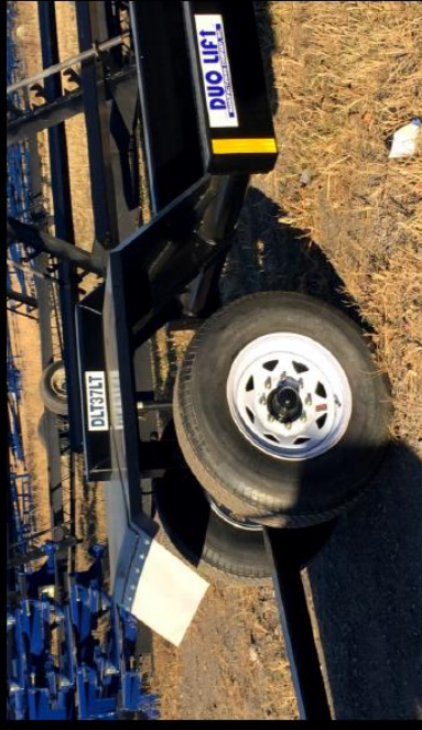
801003 - Extended Coverage Front Fender

Standard: 800821- Flat Header Support On Every Adjustable Chock