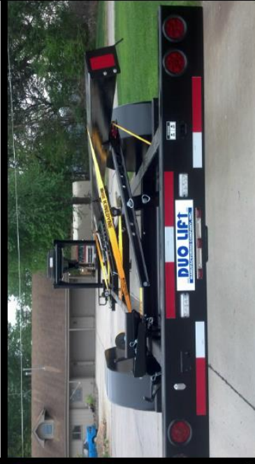
801158 - LED Amber Strobe Light Package for D.O.T. Models