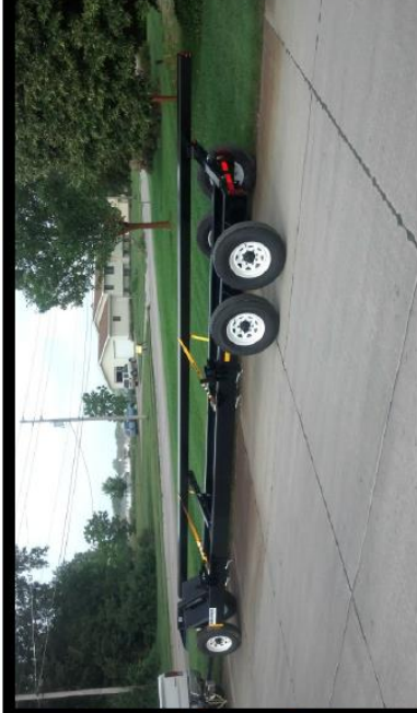
New Model DLT32LT with Tandem Torsion Rear Axle and Ag Light Package