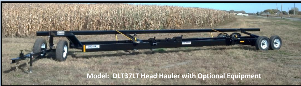
Model: DLT37LT Head Hauler with Optional Equipment